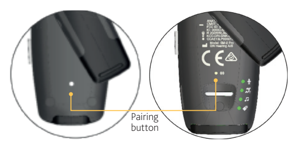
Mini Microphone 2