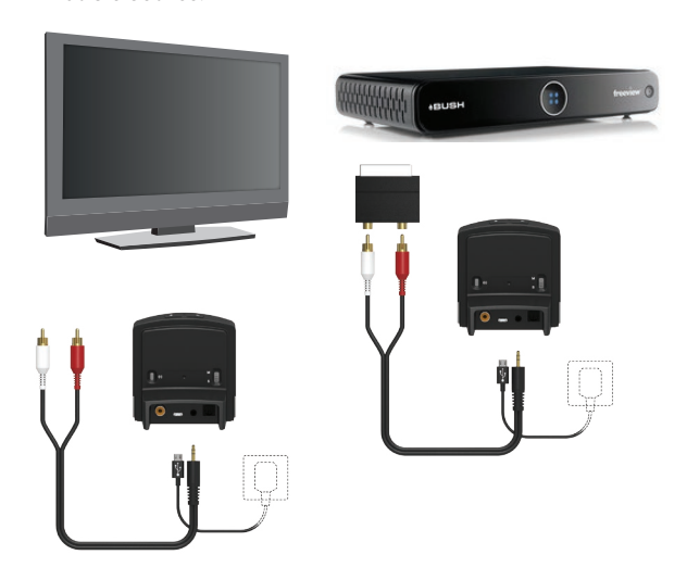
Typical connection to TV or stereo