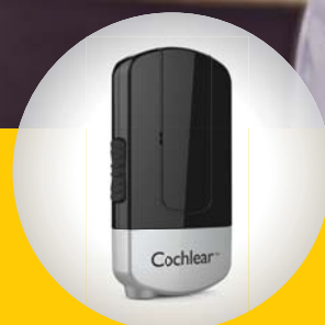
Cochlear™ Wireless Mini Microphone